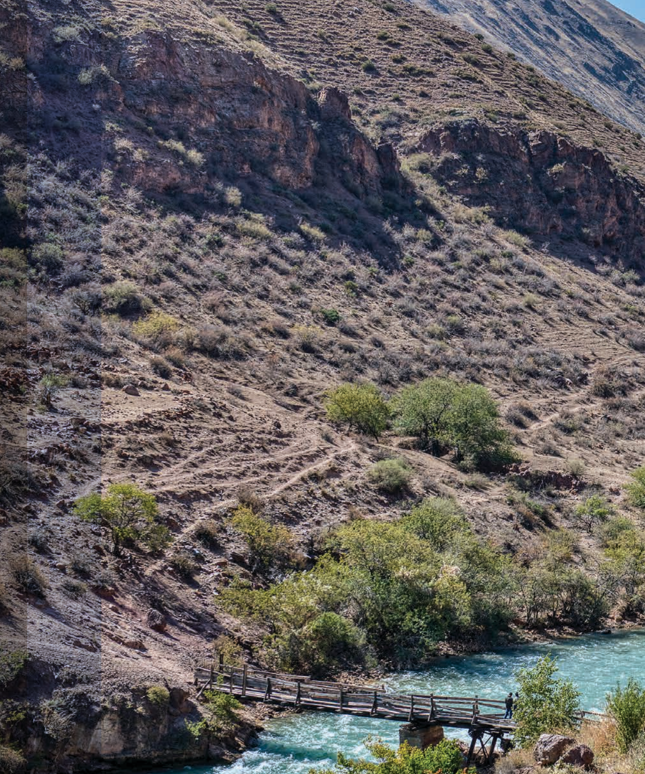
Landslides occur mainly in south-western Kyrgyzstan, where 3,500 out of existing 5,000 landslide zones are located, with over 30–40 landslides taking place per square kilometre in certain areas.