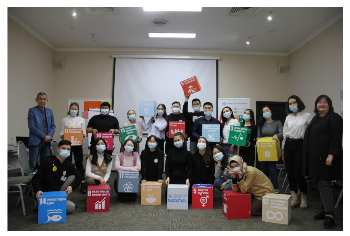
Participants and coaches at the training