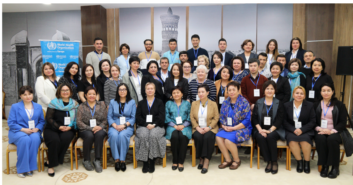
Laboratory biosafety and biosecurity training for national mentors from Central Asia countries. Bukhara, Uzbekistan between 23 - 26 March 22