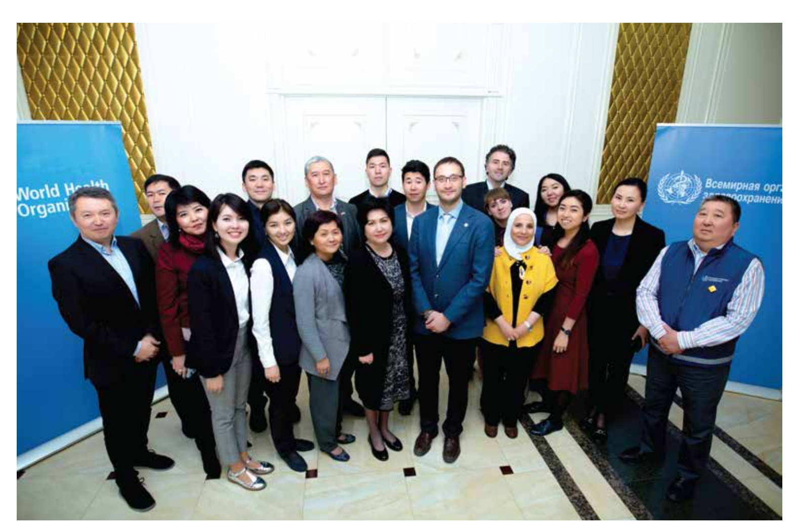
WHO country team in Kyrgyzstan, April 2018

WHO Representative and Head of WHO Country Office